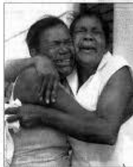
A LOST LOVED ONE: Two sisters comfort each other after learning that their brother had died at sea.